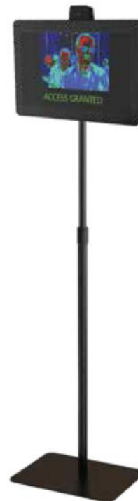
TTS panel shown with optional APS-1 pole stand