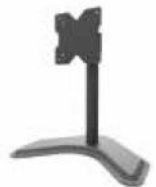
DTM-2 desktop mount