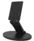
DTM-1 desktop mount