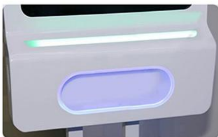
1 - BORDER COLOR SHOWS BLUE WHEN NOT IN USE

To ensure surface contact is kept to a minimum, we have also incorporated a sensor that automatically dispenses the sanitizer when a hand is detected.