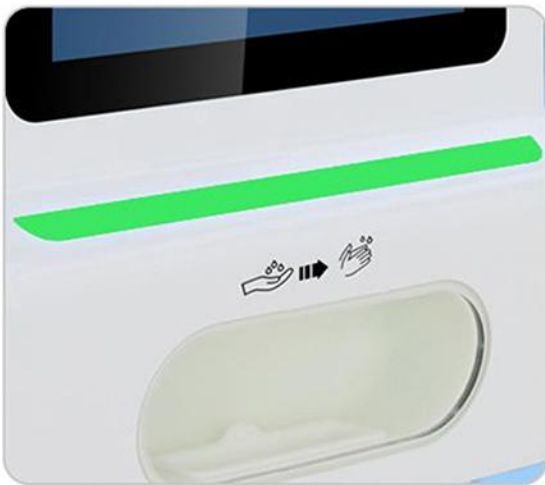
GREEN INDICATOR MEDIUM/FULL

Therefore, keeping the display filled with the sanitizer is of utmost importance. Tell help you with this, we have incorporated Automatic Light Signals to easily identify when the sanitizer needs to be refilled.