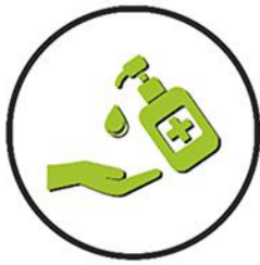
INTEGRATED HAND SANITIZER