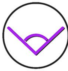
WIDE VIEWING ANGLE