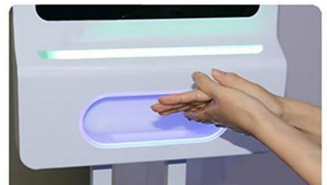
3 - BORDER COLOR RETURNS TO BLUE WHEN HANDS ARE REMOVED