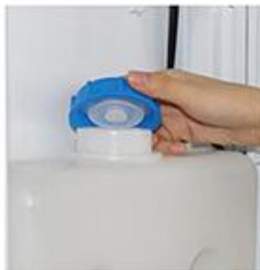
2 - REMOVE COVER