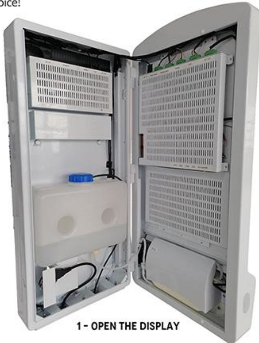
1 - OPEN THE DISPLAY

Simply unlock the display, open the display, open the sanitizer cover and add your sanitizer of choice!