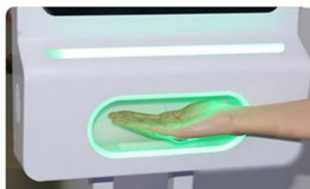
2 - BORDER COLOR CHANGES TO GREEN WHEN HAND IS DETECTED