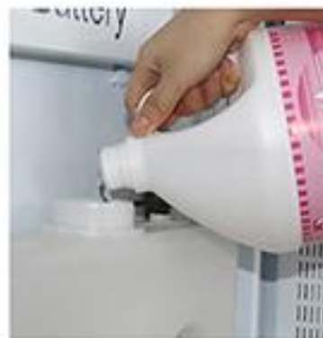
3 - REFILL SANITIZER TYPE (LIQUID/ALCOHOL/GEL)