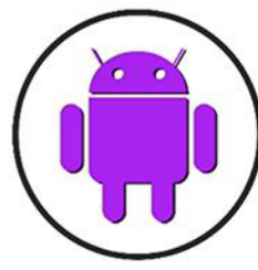
ANDROID OS AVAILABLE