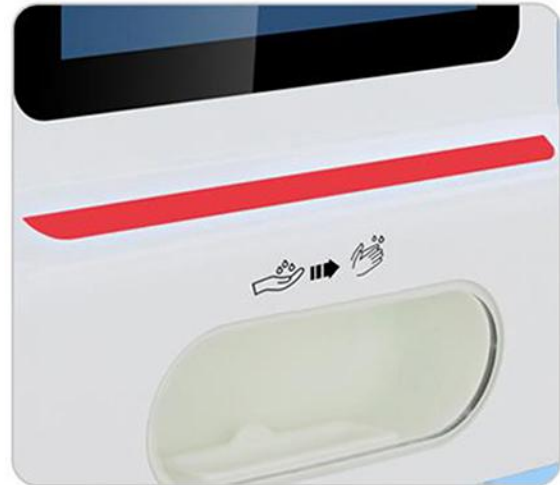
GREEN INDICATOR REFILL REQUIRED/EMPTY