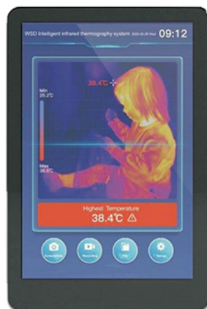
AUTOMATIC ALARM WITH HIGH BODY TEMPERATURE