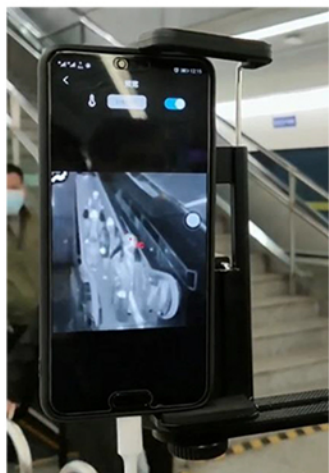
DETECT MULTIPLE TEMPERATURES AT ONCE WITH WIDE FIELD OF VIEW

Ideal when used in conjunction with our SFV model, enabling any abnormal reading to be scanned a second time on a Single Field View device whilst maintaining full traffic flow and preventing the need for long queues when many people need to be checked