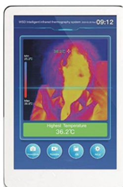
NORMAL BODY TEMPERATURE